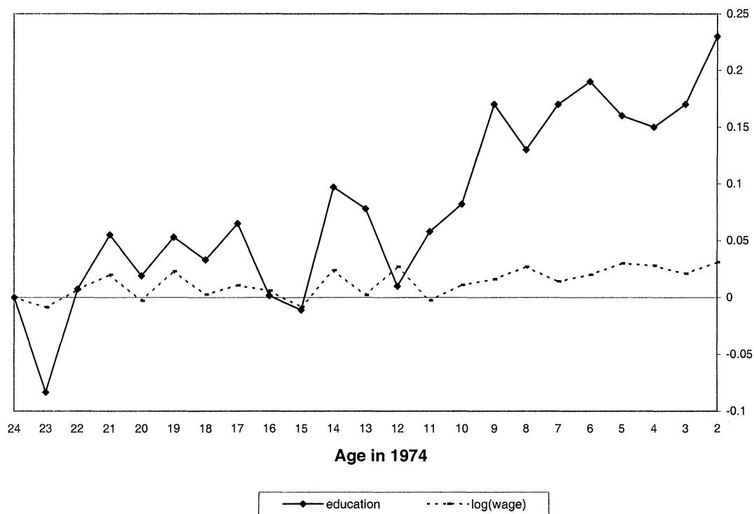
FIGURE 3. COEFFICIENTS OF THE INTERACTIONS AGE IN 1974* PROGRAM INTENSITY IN THE REGION OF BIRTH IN THE WAGE AND EDUCATION EQUATIONS

with valid wage data. Thus, on average, the program caused a 3 to 7 percent increase in the wages of this cohort.